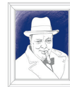
1960 Mappin & Webb supplies Sir Winston Churchill's pocket watches and solid-gold ashtrays

Mappin & Webb is renowned for the quality of its silver creations around the world. We are hugely proud to be expanding our silver manufacture through our own atelier, where we can continue providing the finest service to our clients – now and into the future.