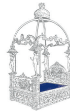
1904 Solid-silver bedroom service created for an Indian maharaja